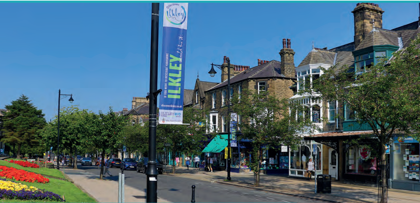
The Grove, Ilkley in Summer 2021, featuring a Discover Ilkley Banner