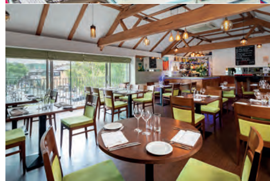
The Vine Restaurant