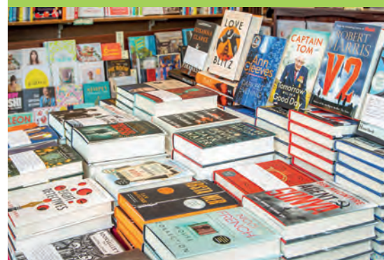
The Grove Bookshop

Throughout 2021 BID businesses were able to utilise the photography service which included two professional photographs and an option to purchase additional photographs at a special discount of £15 each. Please get in touch to use this service if you haven't used it before.